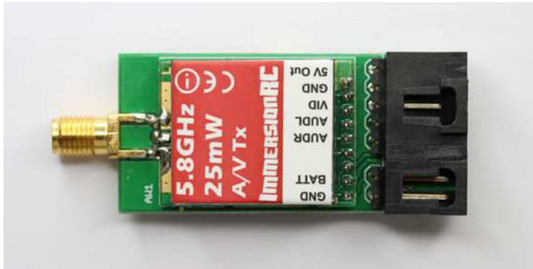
Fig 1. Top side of ImmersionRC 25mW 5.8GHz audio/video transmitter.